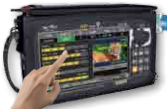
HD TAB 9"