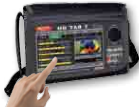
HD TAB 7" EVO