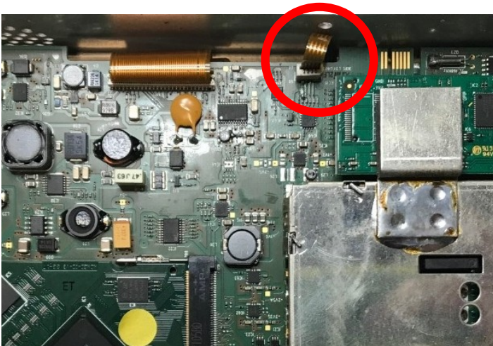
Fig.1 Touch screen flat cable for old display type.